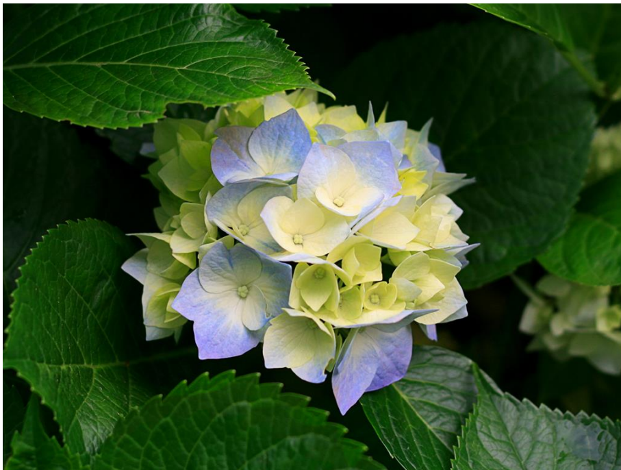
Figure 1-2. Another beautiful hydrangea,