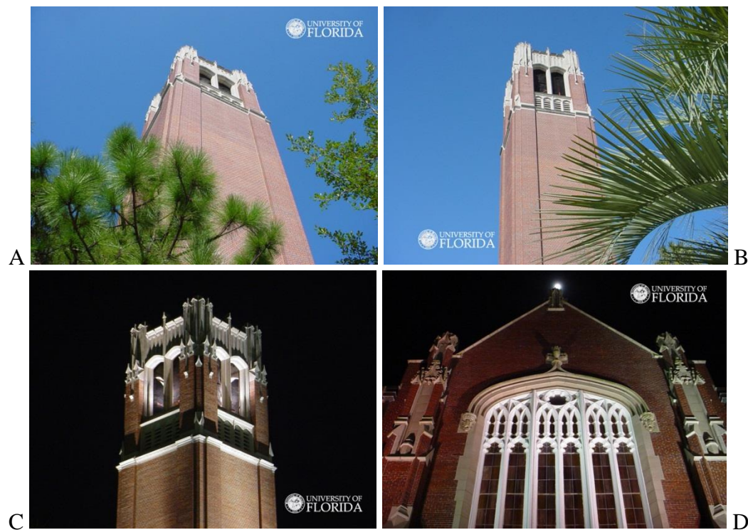
Figure 3-2. Series of University of Florida landmarks. A) Taken from the base of Century Tower looking upward at 3:00 PM, B) taken from the northwest corner of the Music Building, C) taken from the CSE atrium at 9:00 PM and D) the University Auditorium. A, B, & D are labeled correctly but C is ambiguous. (Note: the caption in the list of figures does not include the sub-part