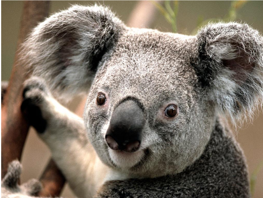
Figure 1-1. Cute koala.